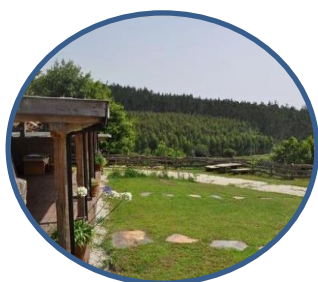
Aloha Summer Camp -2019